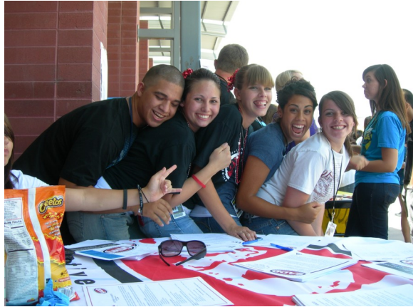
CGUHS SADD Chapter lunch hour tabling

CGA, Inc., a non-profit charity, provides substance abuse prevention education and awareness, treatment resource information, coalition mentoring, & administrative support to the Casa Grande Alliance and other prevention coalitions. These coalitions provide a framework for organizations, families and individuals to address substance abuse issues in the community, and CGA, Inc. provides program and administrative staff for those efforts. Our mission: to build partnerships and work together for the prevention of substance abuse and violence among youth and adults.